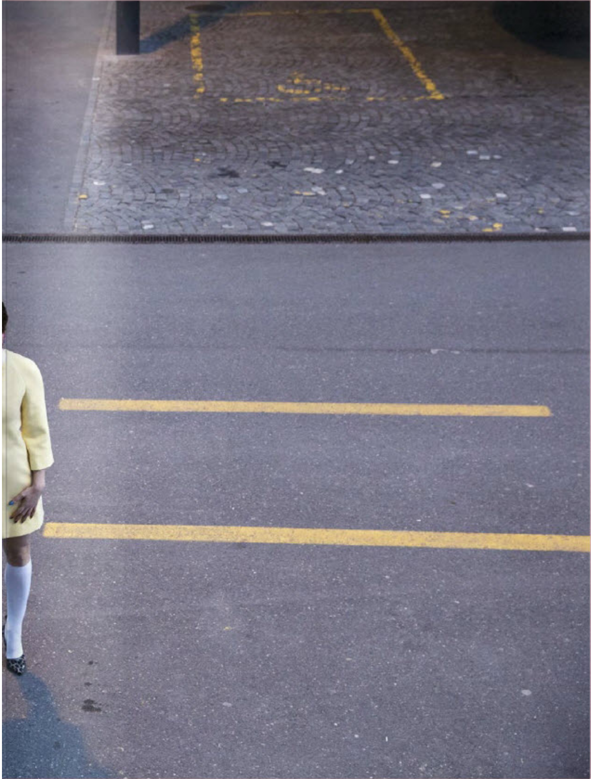
FLARED SLEEVES YELLOW COAT, ZARA / LEOPARD PRINT COURT SHOES, LANVIN FOR H&M / PINK EARRINGS, CREA-TIFF BIJOUX / HIGH KNEE SOCKS, MADISON