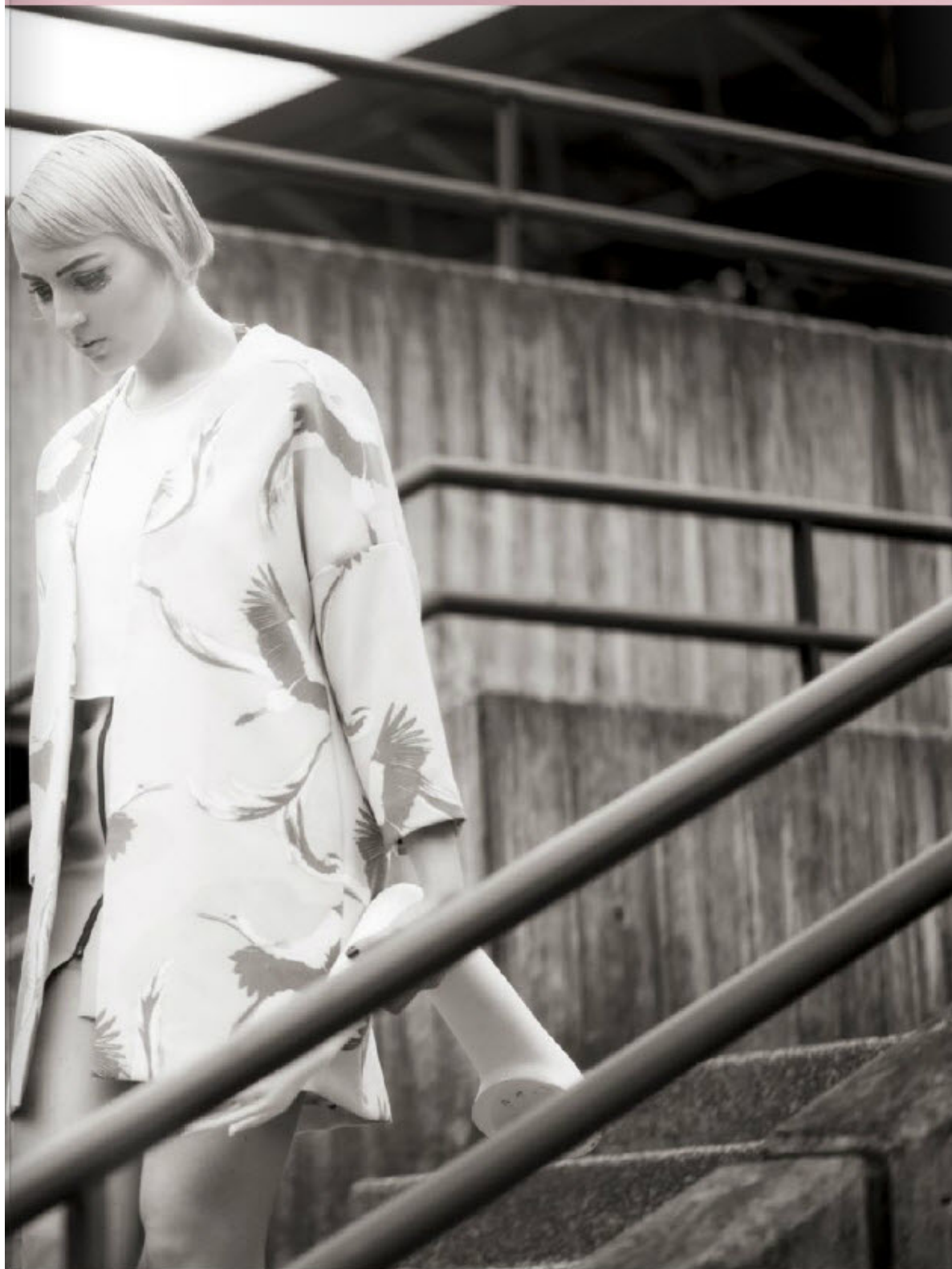
COAT, H&M / SKIRT AND TOP, TOPSHOP / EARRINGS, TIFFANY ROWE